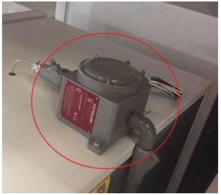
Mechanical Temperature Controller – located in the rear top location of refrigerator or freezer, inside of the metal enclosure.

After making an adjustment, please allow 8 hours' operation before making a new adjustment.