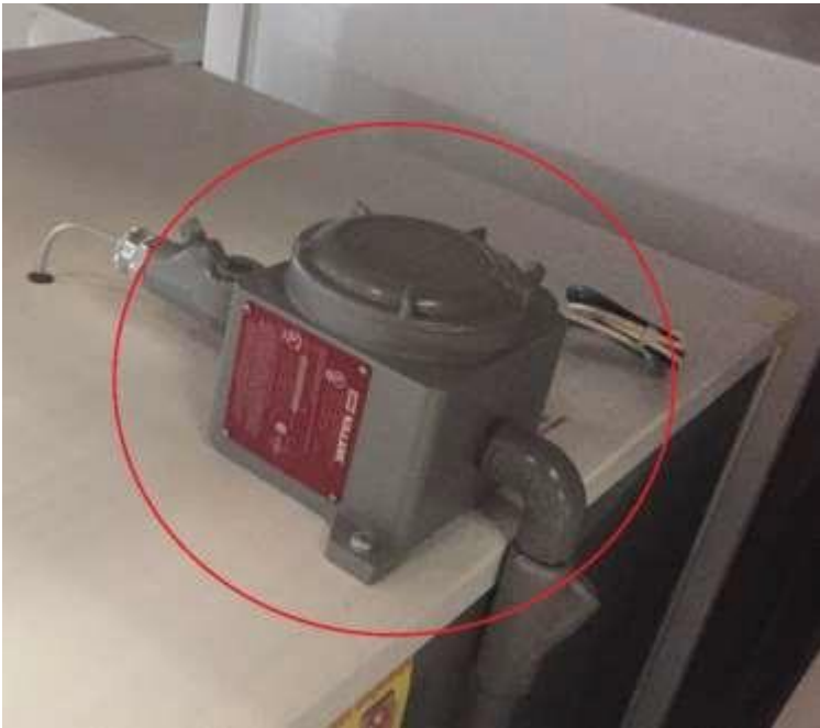
Mechanical Temperature Controller – located in the rear top location of refrigerator or freezer, inside of the metal enclosure.

After making an adjustment, please allow 8 hours' operation before making a new adjustment.